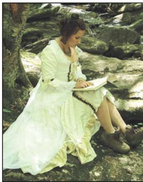
The Marriage of Figaro , a Mozart classic based on a libretto by Lorenzo Da Ponte. Written in 1787, Da Ponte was a poet and friend of Casanova.